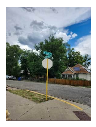
Photo 116: Intersection between W 2<sup>nd</sup> St and Hawkins Ave