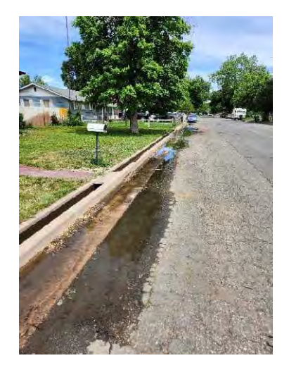
Photo 72 : north edge of E 4<sup>th</sup> St east of N McCandless Ave.