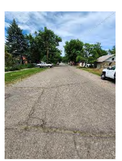
Photo 75: Petroleum Ave, North from the E 4<sup>th</sup> St Intersection