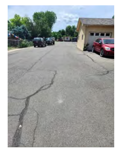
Photo 42: 722 E 3<sup>rd</sup> St (entrance to Alpine Village mobile home park)