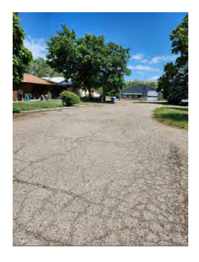
Photo 26 : N Petroleum Ave north of E 7<sup>th</sup> St (Northview)