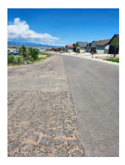
Photo 9 : Arrowhead Drive (north of Highland Drive south intersection)