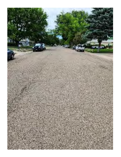
Photo 69: E 4<sup>th</sup> St, Between Crawford Ave & N Robinson Ave