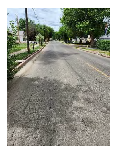
Photo 25: N Frazier Avenue, East of W 1<sup>st</sup> Street by Intersection