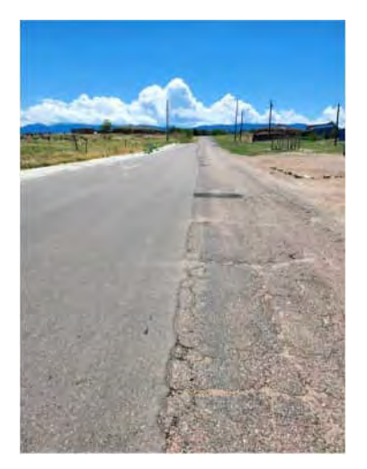
Photo 10 : Arrowhead Drive (south of Highland Drive south intersection)