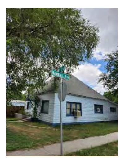
Photo 118 Intersection between W 3<sup>rd</sup> St and Hawkins Ave