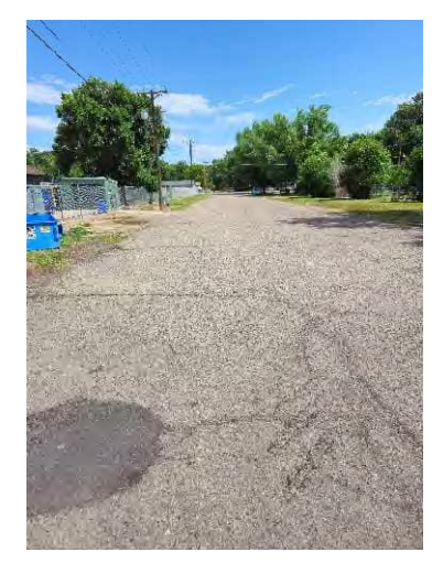
Photo 19 : N Santa Fe Ave. north of W 6<sup>th</sup> St. (Northview)