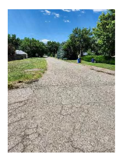
Photo 25: N Petroleum Ave south of E 7<sup>th</sup> St (Southview)